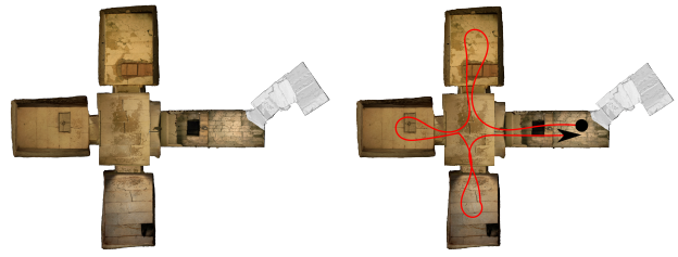
Fig. 2. A case study: On the left side the map of the Palmieri Crypt in Lecce, Italy (top-view). On the right side, the same map with the pre-defined path (in red) created by visit planners for VirtualTour.

We tested our VirtualTour app to navigate the 3D scanned model of the Palmieri crypt, a Messapian tomb built in the 4th