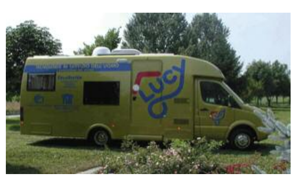
Figure 2: The "Lucy" technological demonstrator.

The main construction material will be timber. Figure 1 shows a preliminary architectural layout of the demonstration building. The building will be accompanied by a use and maintenance manual to optimise its use and prolong its life by enabling an appropriate maintenance schedule, reduced energy consumption, fewer failures and reduced off duty times. The construction site will be open to interested companies and professionals, both physically, in accordance with security requirements, and by web streaming. Also, an information system will be created, containing all the basic information, continuously updated and complemented with the feedback from the maintenance and repair interventions. A full and up-to-date information on all the parts and functionalities of the building will thus be made available for monitoring and maintenance planning, which will also be accessible remotely. The project will last 18 months. At completion, the demonstration building will be used to experiment with new building and technological solutions and train designers and technicians on the new concepts developed.