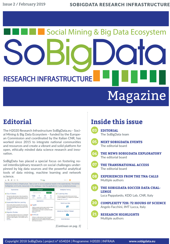
Figure A 3. Cover of Issue 2 of the SoBigData newsletter.