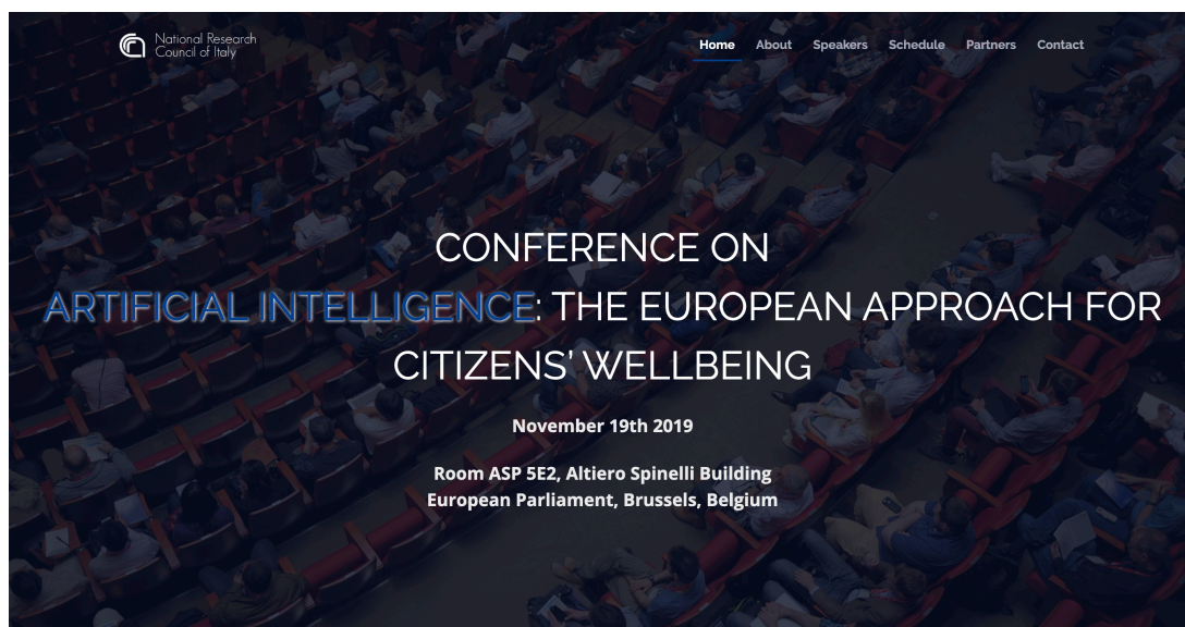
Figure 1: the website of the Final Conference

http://www.sobigdata.eu/events/sobigdata-sobigdata-toward-advanced-community-data-scientists