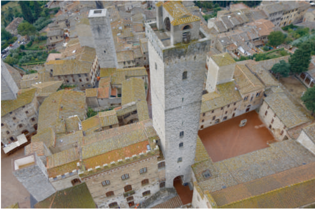
Figure 1. Panoramic view of San Gimignano and Torre Grossa, a case study of Moscardo project.

distances among the various planar markers as well as their orientation. Tests have allowed demonstrating that the results are reproducible. A UAV can obtain that acceptable images under normal operating conditions (no further requirements on wind speed and weather have been required) during daylight. It has been possible to perform routine analysis of cracks and to understand possible seasonal changes in a way that is safe for operators since it is not required to reach damaged and critical areas. Further capabilities of the UAVs might be considered in the future, such as adding infrared vision to analyse defects and other onboard intelligent systems to detect faults (Jalil et al. 2019).