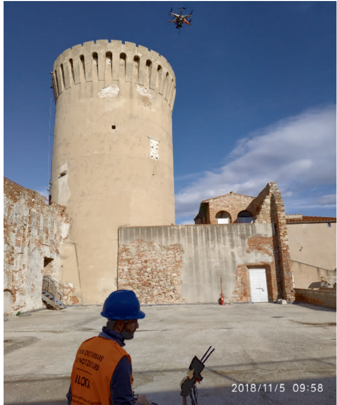
Figure 2. The operator pilots the AUV around Mastio di Matilde, a tower in the Fortezza Vecchia complex in Leghorn, which has been considered as a case study in the framework of Moscardo project.

The first flights executed in the case studies also allowed to acquire image surveys for performing a 3D photogrammetric reconstruction of the monitored structures, which has been used to provide a Virtual Reality (VR) system (Germanese et al. 2018b). Such a VR system aims at enriching the historical building monitoring and providing support to the UAV operator during inspections. For each monitored zone, a detailed photogrammetric reconstruction has been realised and placed inside a 3D scene. The scene also contains all the sensors in the acquisition layer of the IoT platform for SHM. The VR system can retrieve and display the raw data