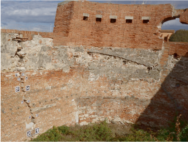
Figure 3. Bastione della Capitana . This area of the Fortezza Vecchia complex has been considered for long time monitoring of cracks and damages in building by AUV inspection. A configuration of markers has been placed around a crack to perform quantitative 3D measurements.

UAV and possible obstacles surrounding the vehicle. In this modality, the interface is composed of three parts: