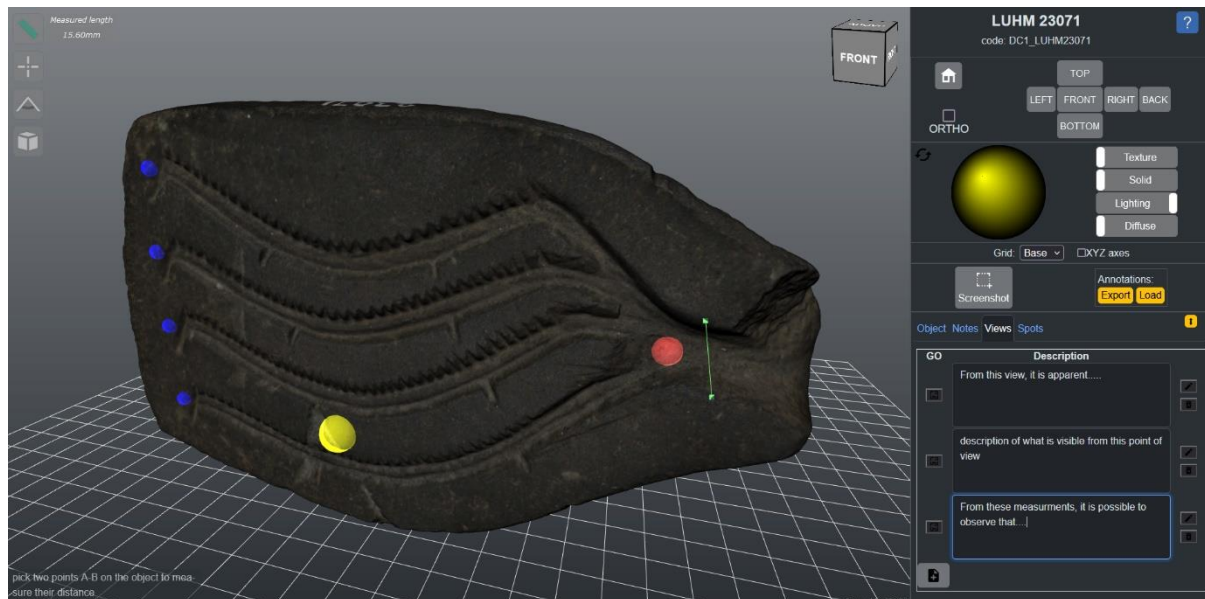
Figure 2 - The single-object viewer, showing an annotated high-resolution 3D model.

Thanks to the multiresolution scheme used in 3DHOP (NEXUS), the high-resolution digital data is stored in a compressed format on the server and streamed in an effective way to the client. The multi-resolution scheme also helps the real-time visualisation, as the rendering is optimised according to the point-of-view, framerate, memory, and network limits.