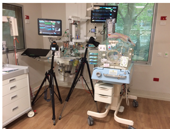
Figure 2. A typical experimental setup for children monitoring in a NICU. Image has been taken from [125].

Early diagnosis plays a key role in most healthcare scopes, including neurological disorder. It is clear that a diagnosis in the first weeks of a child’s life is crucial, especially in preterm infants, to recognise signs of possible lesions in the developing brain and to plan timely and appropriate rehabilitation interventions. Unfortunately, this can only be achieved by monitoring the child lying down, with two main constraints: on the one hand, it is mandatory to use completely non-invasive methods, and on the other hand, considering the specific movement dynamics under investigation, ad hoc datasets are required, underlining what was discussed in the previous section. Beyond this critical analysis, further monitoring can be carried out to track vital signs or movements of discomfort that represent manifestations of the child’s distress. All these kind of analysis are generally performed using a camera mounted at the top of the crib at a neonatal intensive care unit (NICU) as shown in the typical setup for data acquisition and processing is reported in Figure 2.