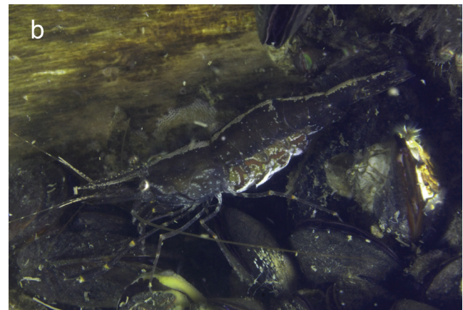
Fig. 2: Palaemon macrodactylus , northern Adriatic Sea: a) Pialassa Baiona, 13 April 2011; b) Sacca di Goro, 22 June 2011.