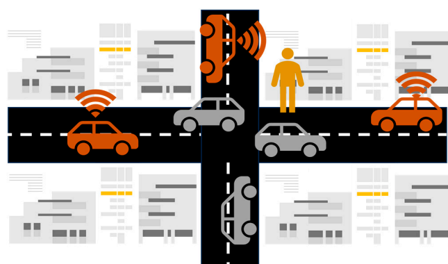
Figure 1. Pictorial representation of the V2V exposure scenario investigated in the current study (please note that the objects displayed in the figure are not in scale). The scenario includes multiple transmitting cars (shown in red) surrounded by non-transmitting vehicles (shown in gray) and a road user (shown in yellow).

In contrast to the previous studies that used simplistic scenarios to assess RF human exposure in vehicular communication [8–11], the current research takes a more thorough approach. It considers additional factors that reflect real-world conditions of V2V communication, acknowledging the complexity of such environments. Figure 1 illustrates the V2V exposure scenario under investigation. Our objective was to evaluate RF exposure within an urban layout (including buildings and roads) caused by multiple transmitting cars (shown in red) surrounded by non-transmitting vehicles (shown in gray). We assumed that the RF-EMF was emitted by V2V antennas mounted on the roof of the transmitting cars. To calculate the exposure dose, we considered that the road user stood alongside the roads.