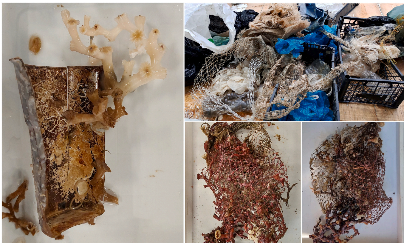
Fig. 2. Example of the various species, including Desmophyllum pertusum growing on macro-litter and recovered by trawling.

DREAM) dedicated to the marine litter removal starting from the derelict fishing gears and other types of litter (Gilman et al., 2022). If this was coupled with the separation of the species of interest from marine litter, the collection of specimens for ecological restoration could increase enormously. This can be done also by equipping the fishing vessels with aquaria. The identification of the target species can be done either providing training to the crew or by promoting the presence of a marine biologist onboard.