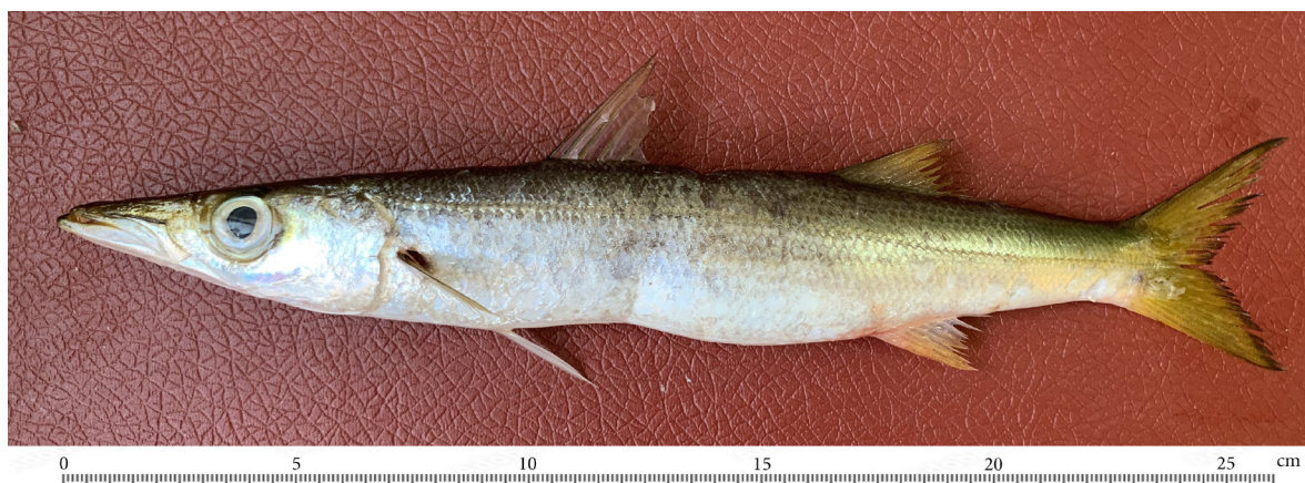
Fig. 2. Sphyraena chrysotaenia caught by small scale fisheries using trammel nets at the south-east borders of the National Marine Park of Zakynthos (Greece, Ionian Sea).