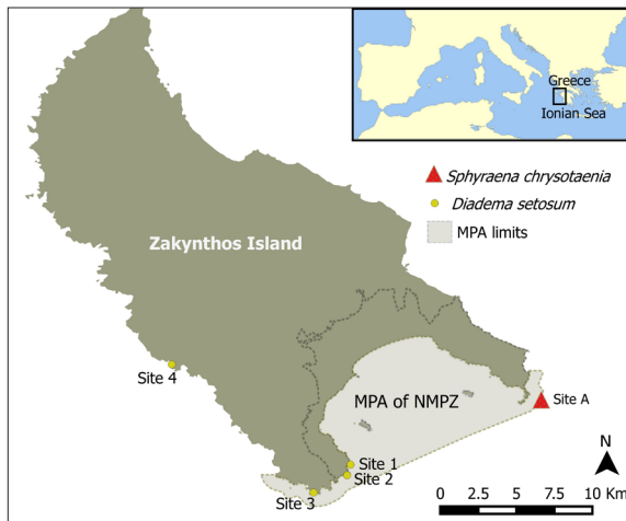
Fig. 1. Locations of records of Sphyraena chrysotaenia and Diadema setosum at Zakynthos Island (Ionian Sea, Greece). The limits of the National Marine Park of Zakynthos are also shown.

Island main port landing site (Figs. 1 and 2). The interviewed fisher brought these individuals to our attention upon realization that they differed from the native barracudas. According to the fisher, these individuals were captured by trammel nets (28 mm mesh size knot to knot) deployed at 30 m depth just outside the easternmost borders of the NMPZ (Fig. 1; Table 1). The col-