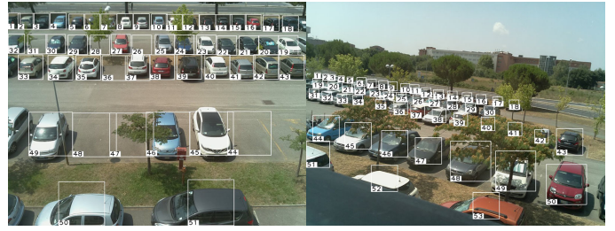
Fig. 1. Parking space patches are segmented and numbered as shown in the two images, respectively forming subset A (on the left) and B (on the right).

Using smart cameras, rather than ground sensors, has two relevant advantages: lower cost and versatility. The cost of a Raspberry Pi equipped with a camera module is about 80€, and the outdoor camera box with pole support has about the same price. One single camera placed on the roof of a 3-floors building, as in our case, can monitor, on average, about 50 parking spaces located in front of the building, thus reducing the cost per single space to a few Euros. The cost of using one ground sensor, per parking space, is one order of magnitude higher. As will be shown in Section III, the accuracy of the proposed approach is high, and it is comparable to the accuracy of the ground sensors. Therefore with a limited expense, compared to installing a single ground sensor for each parking space, it is possible to monitor a large parking lot with comparable accuracy results.