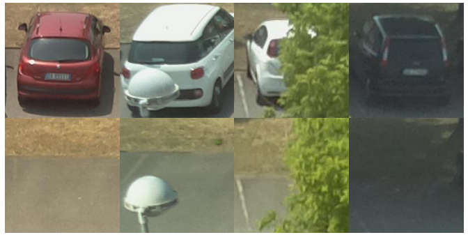
Fig. 2. Training set patches segmented from the camera view. Images show four parking spaces in both status: busy (first row) and free (second row). They also present some occlusion and shadow situations that we faced.

Unlike [7] and [10], both architectures have a dense connection between convolutional layers. The details of both architectures are reported in Table I.