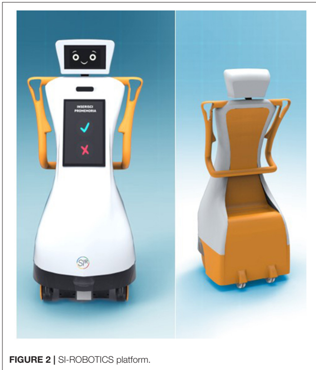
FIGURE 2 | SI-ROBOTICS platform.

the physical therapist. After selecting a difficulty level, players are presented as dancers on the screen, along with footprints that suggest the movement to be done.