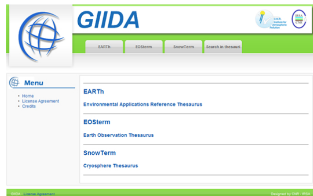
Figure 1: Interface of GIIDA – home page

There is also a search function which allows to check the presence of terms within the various thesauri.