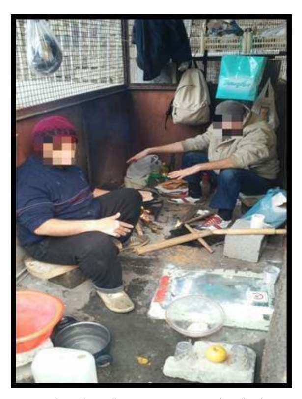
Fig. 2. Everyday life experiences of asylum seekers