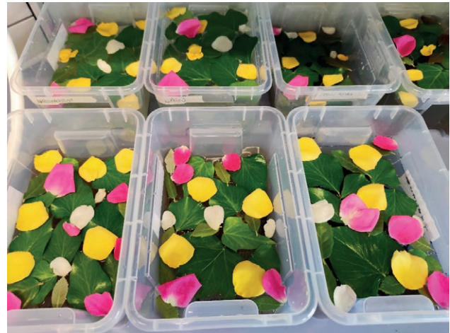
Figure 1. Baiting of water and potted plant samples. Containers were 280 × 190 × 140 mm deep, and each contained 3 L of distilled water. Baits used were young leaves of Hedera sp. and Quercus ilex , and rose petals.

All samples, including Potting soil, Flow-through and Puddles water, and water from irrigation pipes and pond, were immediately processed for isolation of oomycetes in the laboratory, using the baiting technique outlined in Figure 1. The analysis was conducted according to ‘Baiting Method 1’ described by Burgess