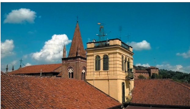
Figure 3. The tower of meteorological observatory in Moncalieri, managed by SMI.

criteria – never changed to maintain the homogeneity of the time series. Since December 2001, an automatic weather station guarantees the continuity of measurements: temperature and relative humidity (in the Stevenson screen, as in the past), air pressure, precipitations, global solar radiation, wind speed and direction. Currently, Società Meteorologica Italiana (SMI) manages the station, collects and studies the recorded data. Data quality is regularly checked in collaboration with the leading Italian metrological institute (INRiM, Torino) within the framework of “MeteoMet” European project ( https://www.meteomet.org/ ): instruments calibrations were carried out in 2012, 2016 and a new campaign is