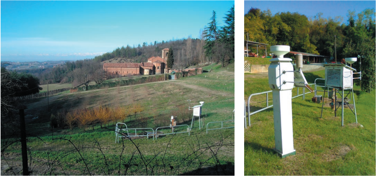
Figure 2. Weather stations at the Vezzolano Experimental Farm: (a) the mechanical station that operated in the period 1961-2005 and, on the background, the Vezzolano Abbey and (b) the automatic station placed near the older one in 2002 by the Regional Agrometeorological Network (RAM). Stations are placed in the in front of the farmhouse.

criteria – never changed to maintain the homogeneity of the time series. Since December 2001, an automatic weather station guarantees the continuity of measurements: temperature and relative humidity (in the Stevenson screen, as in the past), air pressure, precipitations, global solar radiation, wind speed and direction. Currently, Società Meteorologica Italiana (SMI) manages the station, collects and studies the recorded data. Data quality is regularly checked in collaboration with the leading Italian metrological institute (INRiM, Torino) within the framework of “MeteoMet” European project ( https://www.meteomet.org/ ): instruments calibrations were carried out in 2012, 2016 and a new campaign is