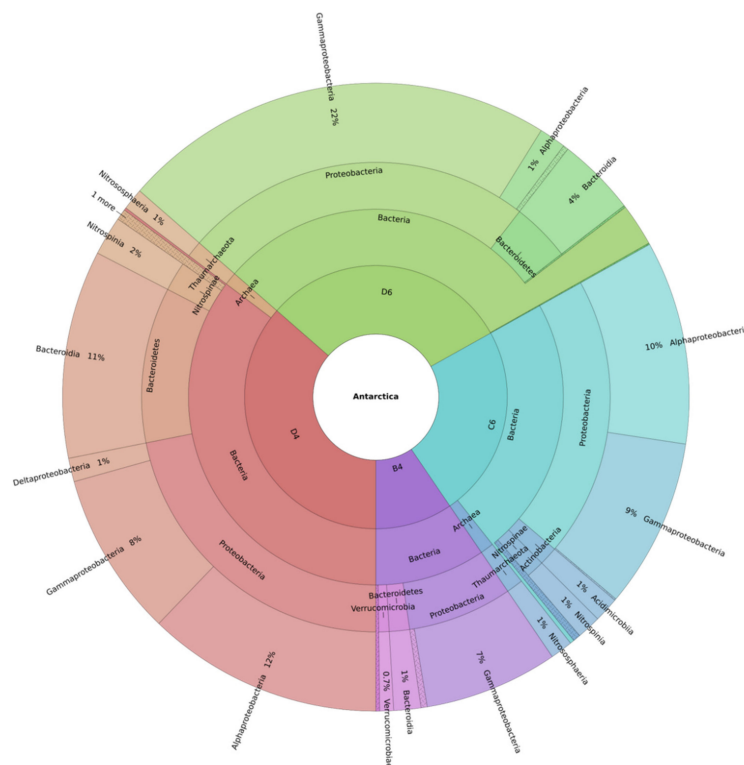
Figure 2. Krona Plot at the class level. Gammaproteobacteria of the genus Endozoicomonas were identified from M. (Oxymycale) acerata as well as Gammaproteobacteria belonging to the genus Colwellia and some bacterial strains classified as Fulvivirga and Ulvibacter , two genera included into Bacteroidetes. Bacteria of the family Rhodobacteraceae (class Alphaproteobacteria) were identified in H. (Rhizoniera) dancoi and H. pilosus . M. sarai was the only species showing a relative abundance of Polaribacter , an additional species grouped into the Bacteroidetes phylum. Sample code: B4 = M. (Oxymycale) acerata ; D4 = H. pilosus , D6 = M. sarai , C6 = H. (Rhizoniera) dancoi . “1 more” corresponds to Acidicrodobiia group, which is present in trace levels.