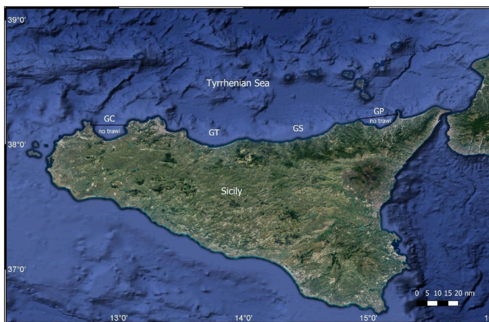
Figure 2. Map showing the four areas investigated: the no-trawl area in the Gulf of Castellammare (GC) and Patti (GP) and the two trawled areas of Gulf of Termini (GT) and Sant'Agata (GS).