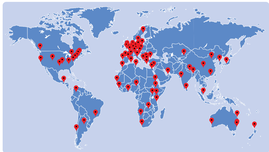
Fig 1 | Geographical distribution of the multidisciplinary experts

This paper addresses an important gap in the field of healthcare AI by delivering the first structured and holistic guideline for trustworthy and ethical AI in healthcare, established through wide international consensus and covering the entire lifecycle of AI. The FUTURE-AI Consortium was started in 2021 and currently comprises 117 international and interdisciplinary experts from 50 countries (fig 1), representing all continents (Europe, North America, South America, Asia, Africa, and Oceania). Additionally, the members represent a variety of disciplines (eg, data science, medical research, clinical medicine, computer engineering, medical ethics, social sciences) and data domains (eg, radiology, genomics,