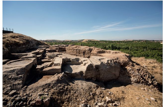
FIG. 2. — Arslantepe, the Iron Age monumental sequence.

In general, animal husbandry at Arslantepe was based on sheep and goat since the earliest time. These comprised slightly more than the half of the total quantity of