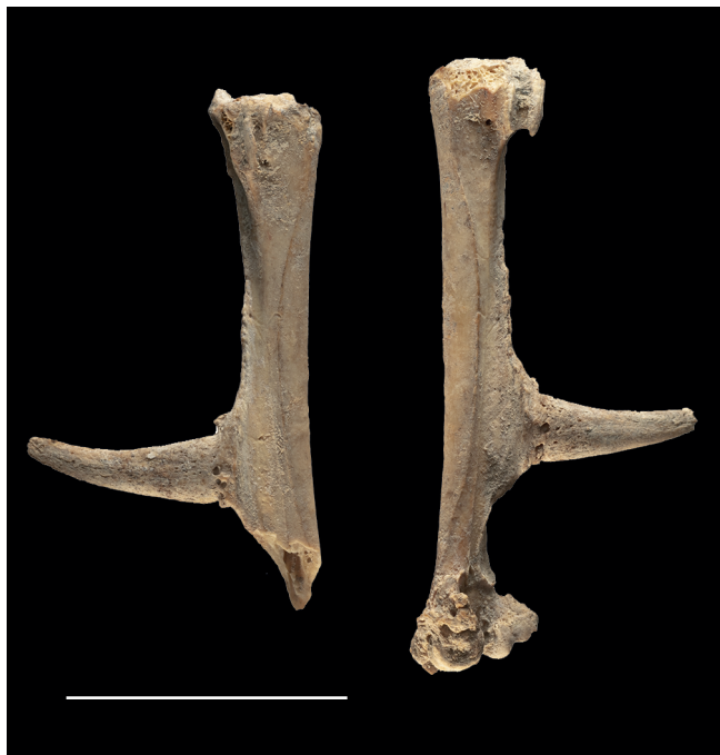
FIG. 4. — Arslantepe, tarsometatarsi (left and right) of rooster from level III B. Scale bar: 3 cm.

Phasianus colchicus Linnaeus, 1758, did not belong to the primeval ornithofauna of the region. Indeed, in its expansion to the West the natural spread of this species was still limited to north-eastern Anatolia (Hill & Robertson 1988). In their westernmost distribution, pheasants of the colchicus taxonomic group were in fact originally confined to the Transcaucasian region between the north Caucasus and the Caspian Sea coasts (Arrigoni degli Oddi 1929; Ghigi 1968). The first reports of P. colchicus in the western oecumene come from a few archaeological sites in Bulgaria and are dated not prior to the Chalcolithic Age (c. 5530-5480 BC) (Boev 1997; Masseti 2002).