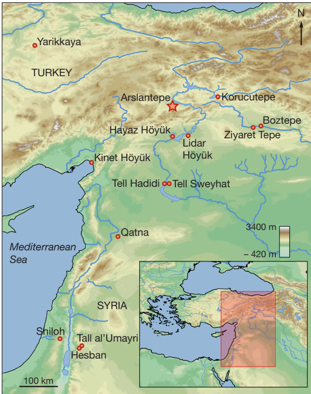
FIG. 1. — Map of Anatolia and the Levant with the main sites mentioned in the text (modified data courtesy of National Centers for Environmental Information – ETOPO1, Natural Earth and Geo Network opensource. https://doi.org/10.7289/V5C8276M ).

As a consequence of the abovementioned long-lasting investigations, the Iron Age archeozoological remains have been over the years analyzed by different researchers. In the 1970s-1990s S. Bökönyi (1983) studied a large number of animal bones related to the Late Bronze and Iron Age levels, and since 2007 faunal material has been analyzed by Siracusano & Bartosiewicz (2012). The Arslantepe rooster was found during the 2015 excavation campaign. The bones have been collected from a filling layer – square G3 (15), layer 8b \alpha – corresponding to the final Arslantepe IIIB level, which is dated through associated material and high precision C14 dating to the end of the 9 th century BC (Manuelli et al. 2021; Fig. 3). This filling layer is associated with the ultimate destruction of the Iron Age fortification wall which sealed the abovementioned silos and pits level. Despite the fact that the bones have not been found in situ and unfortunately not much can be said about their exact context, it seems also reasonable to assume that the remains were somehow originally associated to the phase of use of this storing area or to its final employment as a dump. Another fragment that could be attributed to a Gallus comes instead from the filling of the last pillared hall of Arslantepe IIA – square G3 (13-14), A1142 layer 1a – dated to the 8 th century BC.