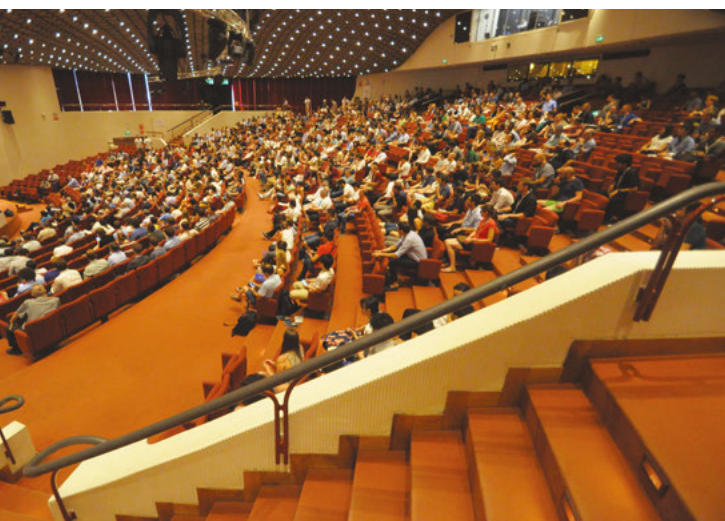
Congress and Exhibition Centre Auditorium during ICOMC 2018.

One of the parallel lecture sessions was reserved on Thursday and Friday to the works of the XIII Conference of the Interdivisional Group of Organometallic Chemistry of The Italian Chemical Society (Co.G.I.C.O. 2018).