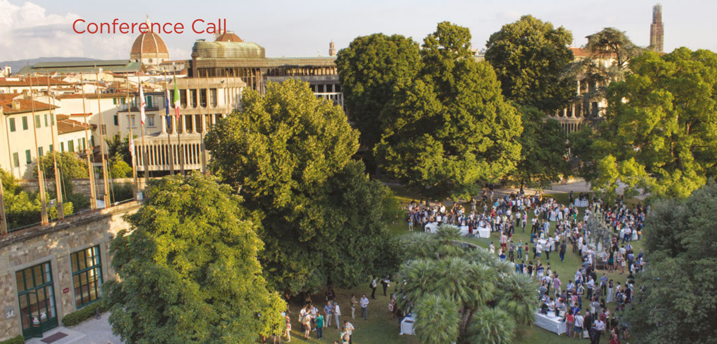
Venue park and welcome cocktail on Sunday 15 July 2018