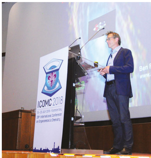
Ben L. Feringa's Plenary Lecture, Thursday 19 July 2018

The XXVIII International Conference on Organometallic Chemistry (ICOMC 2018) was held in Florence, Italy, from 15–20 July 2018. ICOMC 2018 is the 28 th edition of a series biennial events that came back to Italy after exactly 30 years (Torino 1988), and was organized