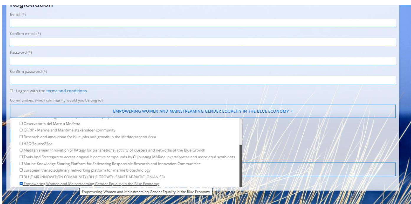
Figure 5: Registration to the WINBLUE community