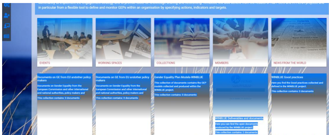
Figure 3: Examples of collections of documents (one of these organises the WINBLUE deliverables and documents)

The WINBLUE is an interconnected virtual community to implement the engagement strategy and to provide tools for knowledge sharing and networking. WINBLUE will also benefit from the results of R&I Peers and ATHENA projects, in particular, from a flexible tool to define and monitor GEPs within an organisation by specifying actions, indicators and targets.