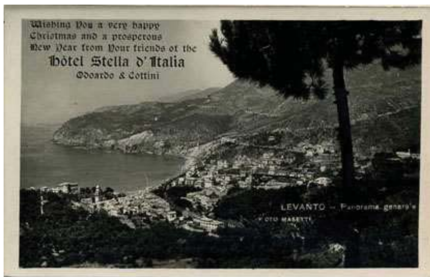
Fig. 01 : Levanto in an ancient postcard

In particular, the economic-commercial and political development of Levanto finds its main explanation in the links that Da Passano family (Lords of Levanto) was able to establish with the Republic of Genoa, as attested by numerous documents dating from the XII th and XIII th centuries [DEL SOLDATO, PINTUS 1984].