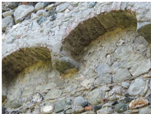
Fig. 04 : Sandstone as pebbles in the city walls

Slate: Slate is not a local material but it comes from the nearby village of Lavagna (30 km far by sea) and from its hinterland where there are wide outcrops. It is the main lithotype of the Val Lavagna Formation-Mount Verzi Member (Upper Cretaceous) (Ligurides Units) where it is present in