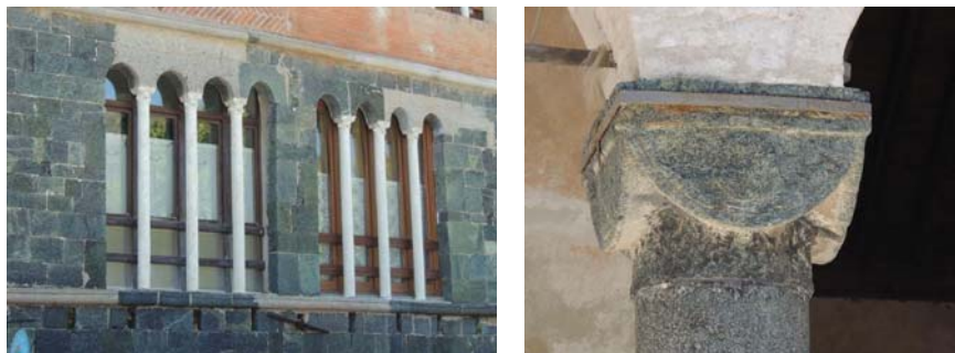
Fig. 03 : Serpentinite in regular blocks (on the left) and in column and capital (on the right)

Sandstones: Two kind of sandstones have been used in the architecture of the village, the Gottero sandstone, belonging to the homonymous formation of the Ligurides Units (Lower Cretaceous-Paleocene) [NIELSEN, ABBATE 1983/1984] and the sandstone of the Macigno-Monte Modino Formation (Upper Oligocene-Lower Miocene) belonging to the Tuscan Sequence [BRUNI et al. 1994]. Both sandstones have been formed through turbidity currents, better known as submarine landslides, able to move and transport large quantities of sediments from the coastal zone to sea bottom (bathyal plain). They are medium to coarse grained, grey to brown grey in colour, and cannot be distinguished at naked eye [ROBBIANO et al. 2006; FRATINI et al. 2014]. Petrographically they can be