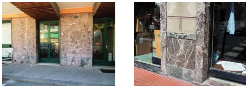
Fig.06 : Serpentine in the cladding of the old railway station (on the left) and the external facing of a shop (on the right)

and baseboards, such as external facings of shops, luxury palaces, staircases of villas of many Ligurian towns (fig.06).