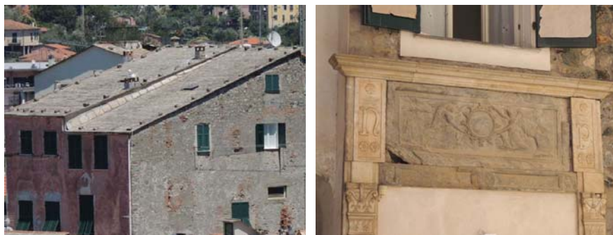
Fig.05 : Slate as roof tiled (on the left) and in a bas-relief (on the right)

layers 1-10 m thick made of marly clays and marls (calcite 20-65 %), leaden grey in colour, alternated with arenite layers [AA.VV. 2015]. The Val Lavagna slate has been subjected to two main phases of ductile deformation under conditions of very low metamorphic degree (facies pumpellyite-actinolite) associated with two planes of foliation [MARRONI, PANDOLFI 1996]. The interference of these two phases gave rise to the development of a slaty cleavage defined by very thin levels of clay minerals (illite, kaolinite and chlorite) which, with an anastomosing course, trap calcite microliths [CORTESOGNO et al. 1998a, b]. The first documents indicating the extraction of slate for the construction of roof tiles (abbadini) date back to the X-XI century [SAVIOLI 1988]. From Lavagna, by sea, the material reached all the coastal and inland locations. While remaining, that of the roof tiles, the main use, the slate was also used for flooring, doorposts, lintels, sills, thresholds, steps, baseboards but also for the construction of vessels for oil and water, school boards. A peculiar use of slate was as bearing for paintings, because slabs do not warp as wood does, and to realize bas-reliefs and sculptured architectonic elements [MARCHI 1993]. In Levanto all these different uses can be observed (fig.05).