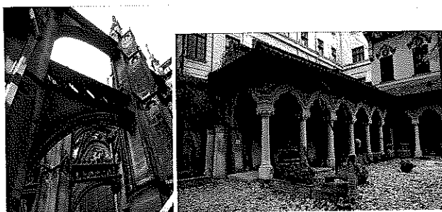
Figure 2. Example of different decay phenomena on outdoor stone materials in two of the selected sites: extensive biocolonization in Cologne Cathedral (Germany) (left) and surface dissolution and erosion on Stavropoleos Monastery in Bucharest (right).

All the selected monuments have the three different building material types, i.e. stone, wood and glass. Each of these monuments has particular regional features regarding composition, manufacturing technology and decay pattern. The preservation effects of alkoxides will be evaluated in all sites both on replicas, appropriately identified, and on real surfaces during 18 months to assess the climatological and environmental indoor and outdoor effects on alkoxides performance. At the same time, the same treated samples of previously chosen materials will be exposed in all the climatological regions to compare the effect of the different environments.