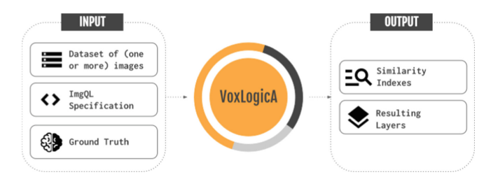
Fig. 2. The VoxLogicA process and architecture

Figure 2 shows the underlying architecture of VoxLogicA and its GUI. From the analysis of different tasks related to different classes of users, we conjecture that the GUI displaying both input and output in a single window plays a central