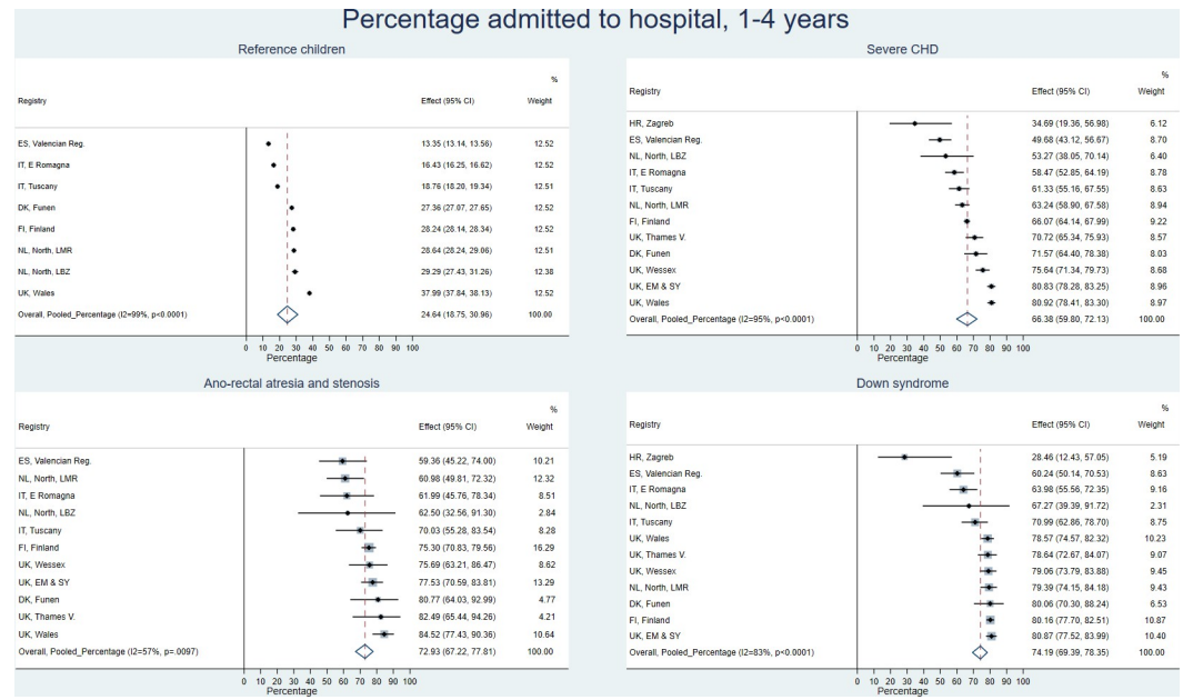
Fig 1. Meta-analysis of percentage hospitalised between 1–4 years for selected anomaly subgroups and reference children. Registry specific percentages (1-Kaplan-Meier estimate) of children ever hospitalised between 1–4 years and pooled percentage (based on 1-Kaplan-Meier estimates) estimated from meta-analysis of all available registers. Registries with <3 cases in subgroup not included. CHD = Congenital Heart Defects.

https://doi.org/10.1371/journal.pone.0269874.g001