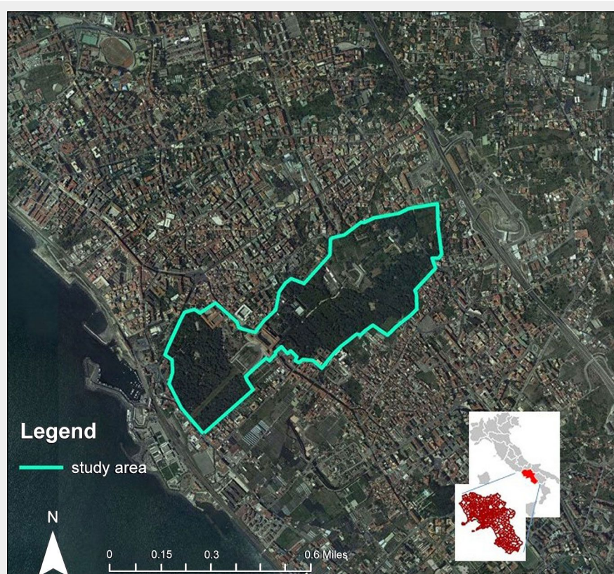
Fig. 1 - Perimeter of the Royal Park of Portici, Campania Region, Southern Italy.

To define the allergenic potential of the Portici Royal Park, it was necessary to draw up an inventory of plant species, and assign each species its own allergenic power. For cataloging, reference was made to the work carried out by Stinca & Motti (2009) on the vascular flora of the Royal Park. The floristic list created by these authors is based on field surveys conducted from 2005 to 2009 and on bibliographic data. The authors found 449 species with a high incidence of Mediterranean species (41.7%) and a greater presence of alien species compared to endemics. According to the authors, the plant community of the park could be defined as a thermophilic or thermomesophilic phytocoenosis with a large representation of the Q. ilex species with an arboreal-shrubby (Mediterranean maquis) or arboreal bearing. However, the community is evolving and shows a progressive reduction of the holm oak ( Q. ilex ) replaced by deciduous broadleaf trees such as flowering ash ( Fraxinus ornus L.), hornbeam ( Carpinus betulus L.) and Mediterranean hackberry ( Celtis australis L.). For an investigation aimed at defining the allergenic potential of the entire area, all the tree and some shrub species were selected from the floristic list. Among these species,