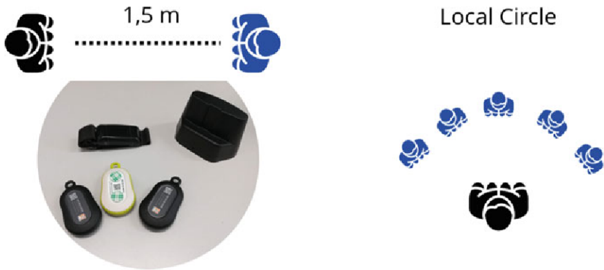
Fig. 1 The NESTORE kit for detecting proximity between users

relationship might not hold because obstacles, multi-path fading, interferences and human bodies can alter the quality of the signals [2]. Both the emitter and the receiver have been designed to operate continuously without the explicit user intervention.