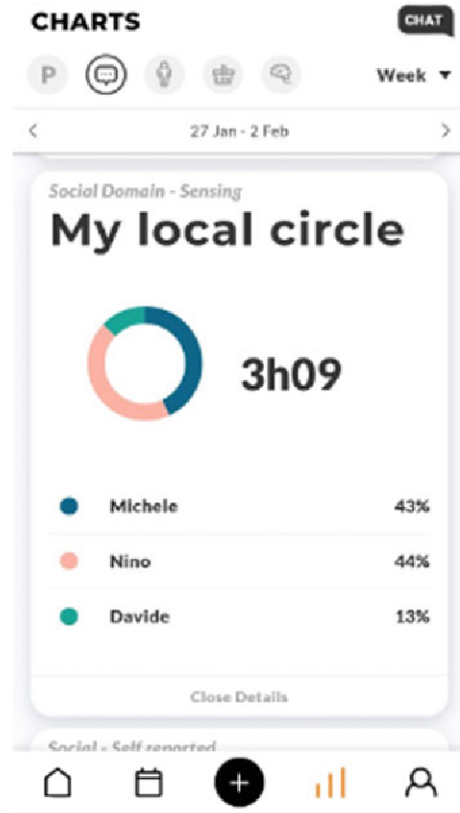
Fig. 2 The local circle metrics available within the NESTORE app

Concerning the first aspect, it is out of the scope of this project to provide a qualitative assessment of the interactions, rather we aim to demonstrate the possibility of automatically inferring the existence of a social interaction by exploiting sensing devices based on commercial and massively available technologies (e.g., Bluetooth Low Energy protocol). Concerning the second aspect, we did not introduce not-intuitive metrics, as they might dissuade the end-users to keep using the