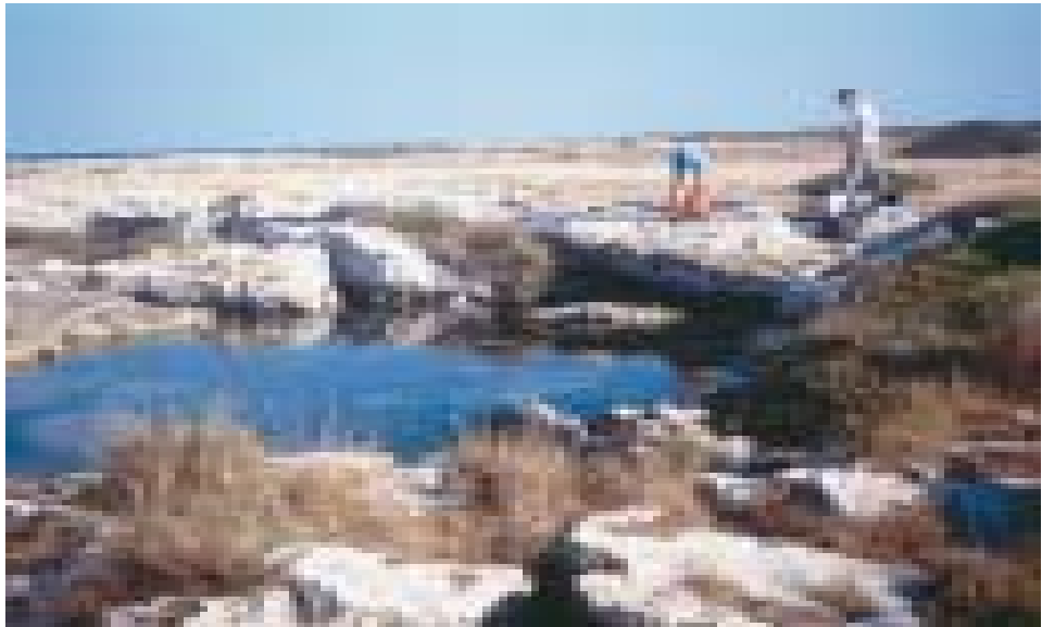
Fig. 8: A spunnulata in the Upper Pleistocene calcarenites of Salento, with evidence of the surficial water table.

During this study, in addition, it was noticed that the name of many localities in Apulia is strongly related to the presence of water, and/or to peculiar karst phenomena. Since in many cases the anthropogenic activities carried out in the last centuries have strongly changed the original morphology and landforms, investigating these names represents a precious clue to identify old features, today lost, in this karst landscape. In turn, this represents an incentive toward more detailed studies on the toponymy and etymology of terms and localities in the apulian karst.