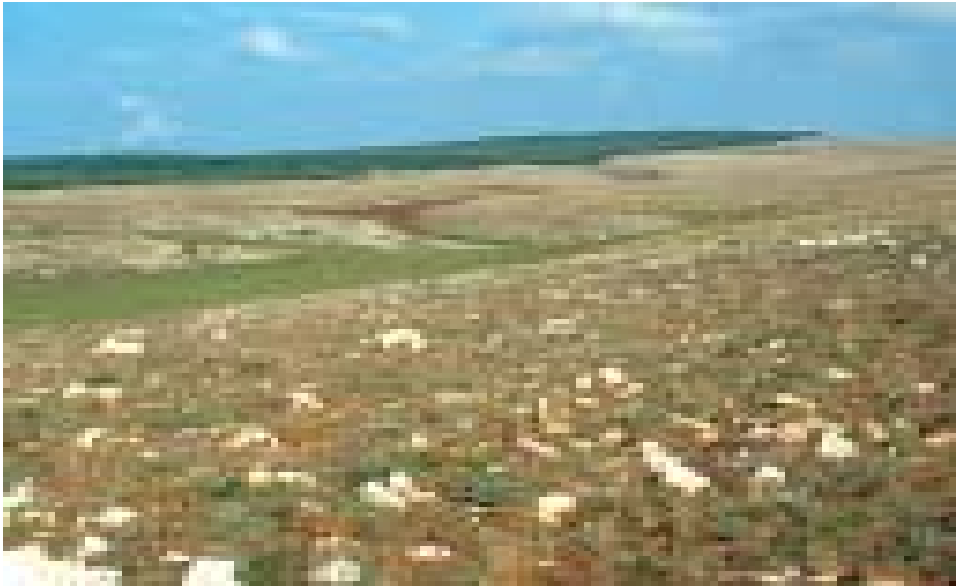
Fig. 4: A lama in the inner Murge plateau. Note the soils and terre rosse which outline the development of the karst landform.