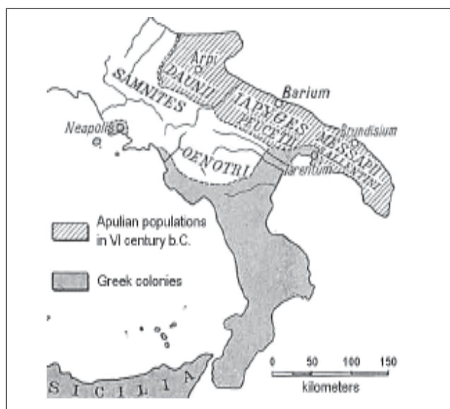
Fig. 2: Distribution of Apulian populations in the VI century B.C. (modified after Baldacci, 1962).