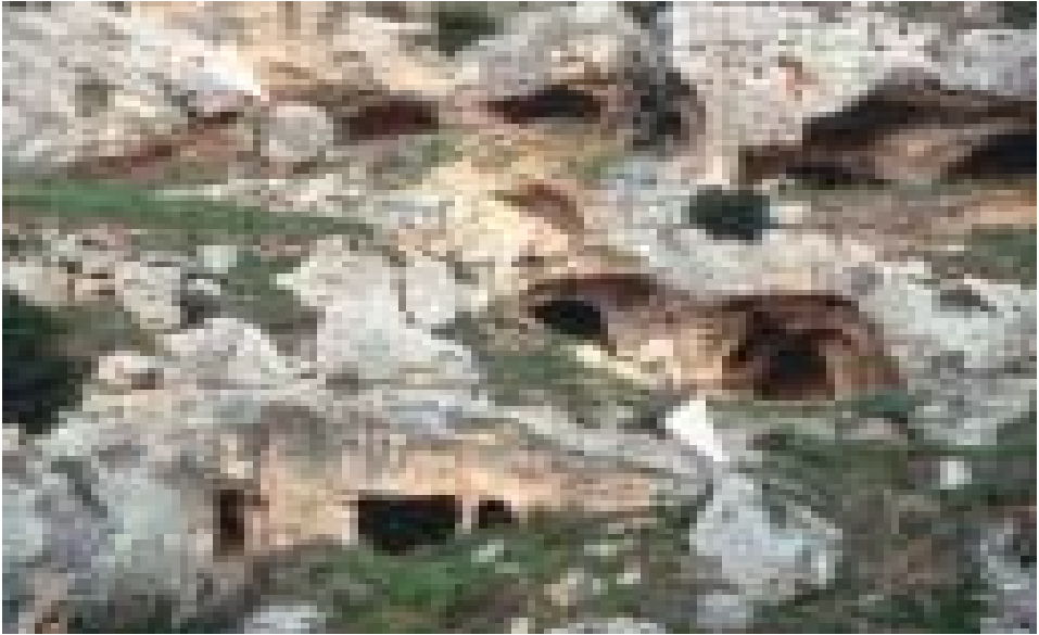
Fig. 6: Rock fall blocks (marked with white arrows) along the flank of a gravina. Note the high number of caves which were inhabited in medieval age, at the time of the so-called “rupestrian civilization”.