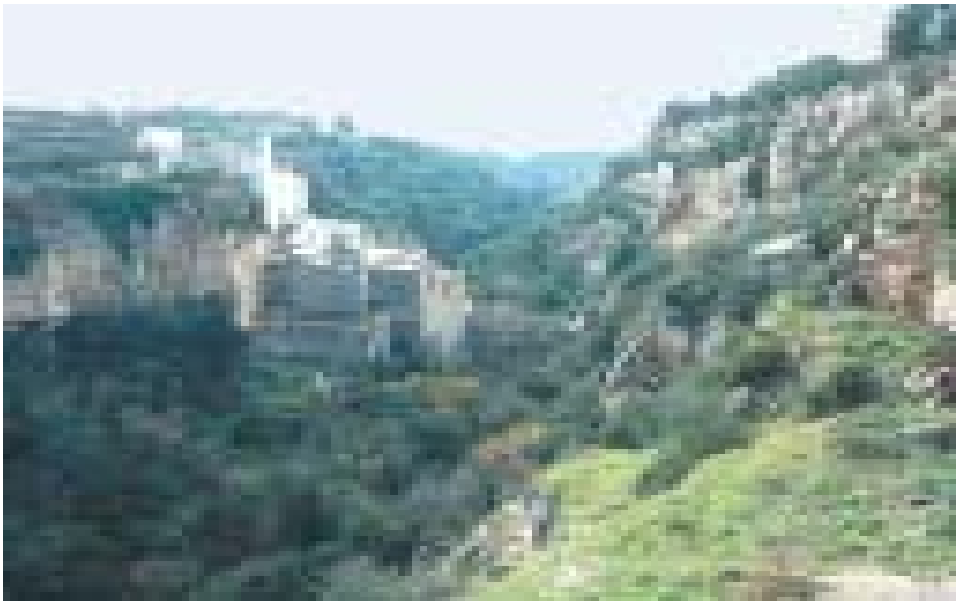
Fig. 5: View of the Gravina Madonna della Scala at Massafra, in the Taranto province. Note the vertical walls of the valley, which strongly contrast with the flat landscape of the lama shown in Fig. 4.