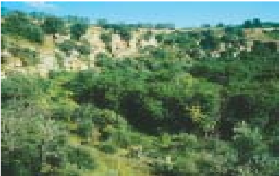
Fig. 7: The Gurgo di Andria, one of the largest collapse dolines in the Bari province.