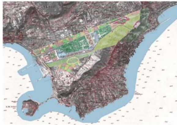
Figure 2. Lamont Young Project (1883–1888). GIS cartography realized by at the Laboratory on the Landscape of the CNR/ IRET implementing orto-imagine 2007 of the Province of Naples, Extract n° 8 of the Cartography of 1817–1823. Graphical elaboration by Marina Russo.

(Figure 2). The utopia of the Anglo-Neapolitan architect will be overturned by a reality that has decreed the environmental destruction of one of the most evocative places in Naples.