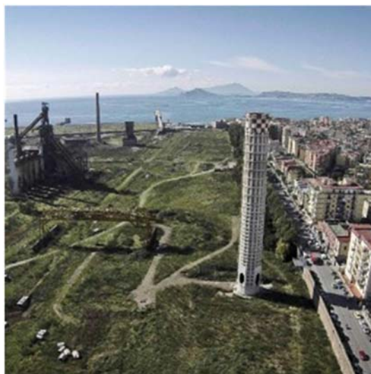
Figure 4. View of the urban void left by the decommissioning of steel plants.