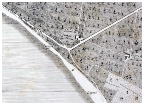
Figure 1. Topographical map of the city of Naples and its outlines (Giovanni Carafa Duke of Noja, Naples, 1775) [6].

The evolution of the coastal landscape in the western area of Naples can be analyzed using historical cartography to understand how anthropization has modified the coast over two centuries. The historical cartography of the Phlegraean area is scarce. To obtain cartographic information, we must refer to the most complete maps of the city of Naples, whose landscape outlines [4] continue towards Campi Flegrei and its most famous areas, such as Nisida, Agnano and Astroni. These representations show an uninhabited and marshy agricultural area, with few architectural additions. The circular tower of Nisida, represented in the cartographies of the 17th century, stands out in the well-known representation of De Fer, "Les Merveilles de Pozzuoli", from 1701 [5]. In the map of Giovanni Carafa Duke of Noja (Figure 1) [6], Bagnoli is characterized by its seashore and by the cultivated areas of Coroglio. The road system that would influence the evolution of the 19th century road network is also clearly discernible, based on two lines that connect Pozzuoli with Naples: "the road that leads to the city of Pozzuoli to the marina" and "the road from Pozzuoli to the mountain".