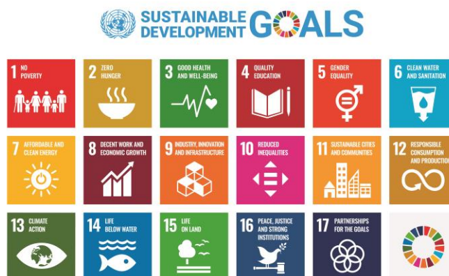
Figure 1 - UN Sustainable Development Goals

SDG 5, SDG11, SDG 16), and reduction of food waste. Moreover, AI and IoT can boost the transformation of productive economic systems by accelerating the adoption of sustainable business models and practices (e.g., SDG 8, SDG 9, SDG 12).