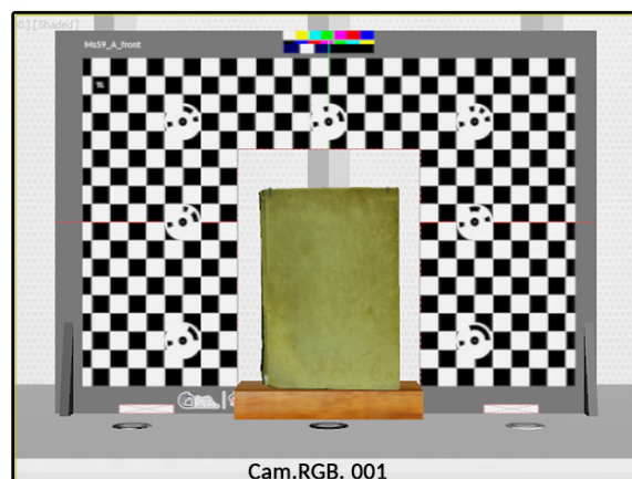
Fig. 1. Photograph of the markers used to align thermal and RGB cameras

In this study the depth-resolved analysis capability provided by active infrared thermography (IRT) is applied in combination with 3D image-based techniques in order to obtain a representation of the subsurface features buried into historical books. The procedure utilized for the generation of thermal texturing [4] makes use of a texture mapping algorithm. Active thermography has been employed to record thermograms of the investigated manuscripts from different viewpoints and beside the manuscript. Moreover, in order to perform a robust orientation among thermal and RGB images, homologous image, obtained by shooting the same checkboard, coordinates were used (Fig. 1). As it will be shown, the image coordinates of such markers play a crucial role in the model thermal texturing.