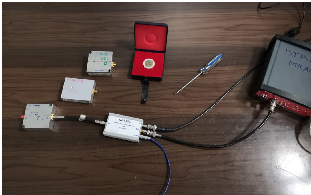
Figure 1. Experimental setup. On the right the three SiC detectors are shown inside their aluminum casing (from top to bottom: SiCD, SiCE and a third SiC, not used in this work). The bottom SiC is connected to the Cividec Preamplifier, powered by a 12 V power source (blue cable at the bottom) and supplying the detector the bias tension (top cable). The middle cable feeds the signal, shaped by the preamplifier, to the CAEN 5730 ADC (on the right). The electrodeposited ^{241}\text{Am} source (on top, inside the red box) is put on the top of the aluminum casings, the holes in which allows alphas to reach the active volumes beneath.

The detectors and the electronic chain are depicted in figure 1. Two different SiC250 prototypes, named SiCD and SiCE, are installed in aluminum casings connected with the ground, acting as a Faraday cage. Each of the detectors is connected to a Cividec SiC Amplifier [34], which was developed on the specific characteristics of the SiC. The preamplifier conveys the supplied HV to the detector and amplifies the signal obtained, forming it into a 100 ns long semi-Gaussian shape. The signal is then read by a CAEN 5730 analog to digital converter [35] which identifies events through a threshold-over-baseline method.