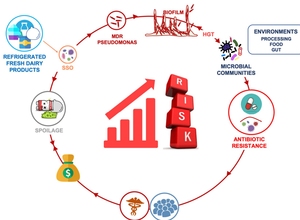
Figure 1. Routes of spread and impacts of antibiotic resistance of psychrotrophic pseudomonads spoiling refrigerated fresh dairy products and spreading throughout different environments.